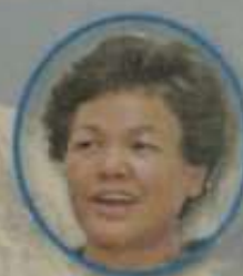
BACHENDRI PAL India, 1984