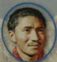
TENZING NORGAY Nepal-India, 1953