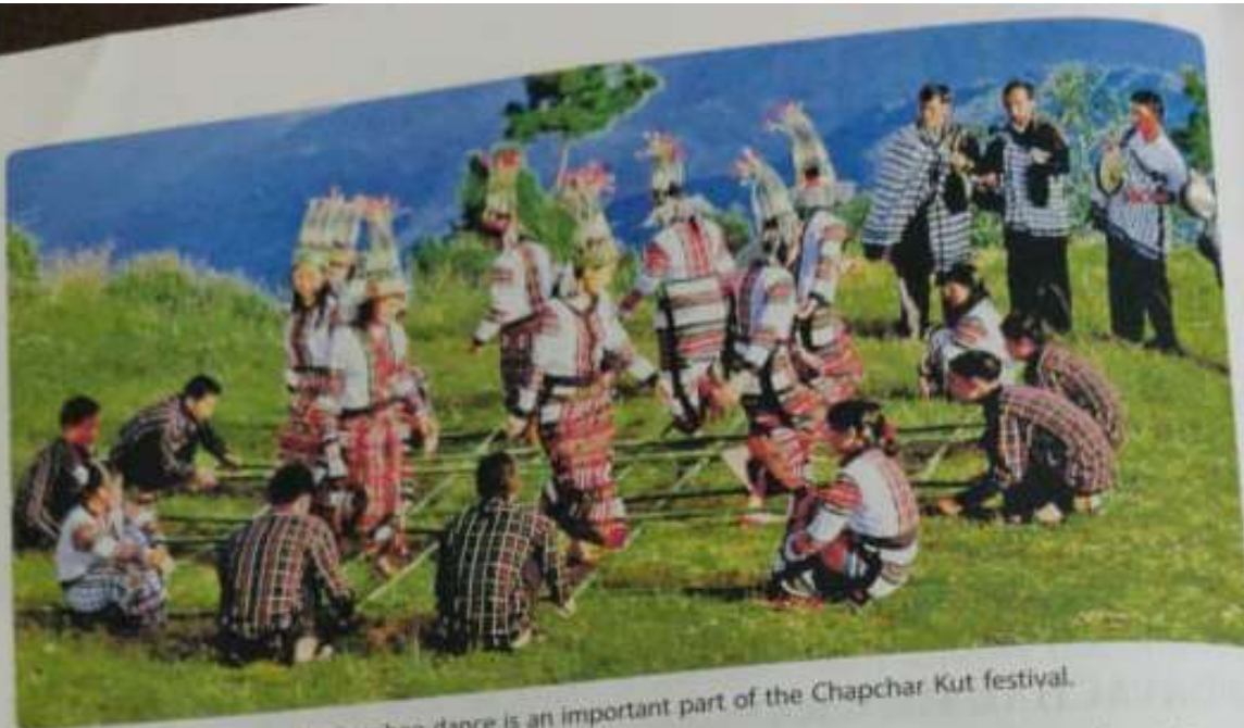
Cheraw or the bamboo dance is an important part of the Chapchar Kut festival.

important occupations. The Nagas wear shawls of different designs. We can tell the tribe a Naga belongs to from the design on her/his shawl. Kohima and Dimapur are places of tourist interest.