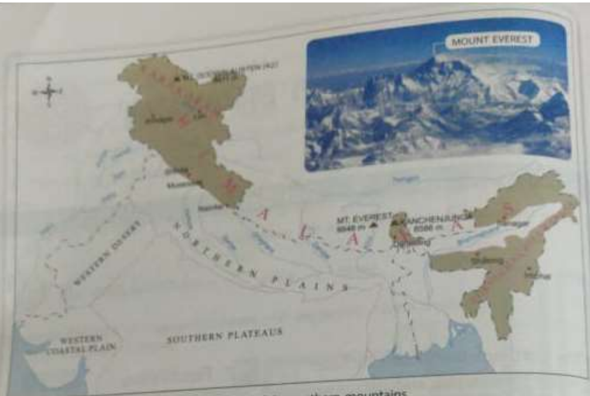
Map 2.1 Location of the northern mountains