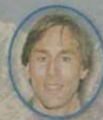
ERIK WEIHENMAYER USA, 2001

For detailed instructions, see inside front cover.