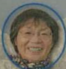
JUNKO Tabei Japan, 1975