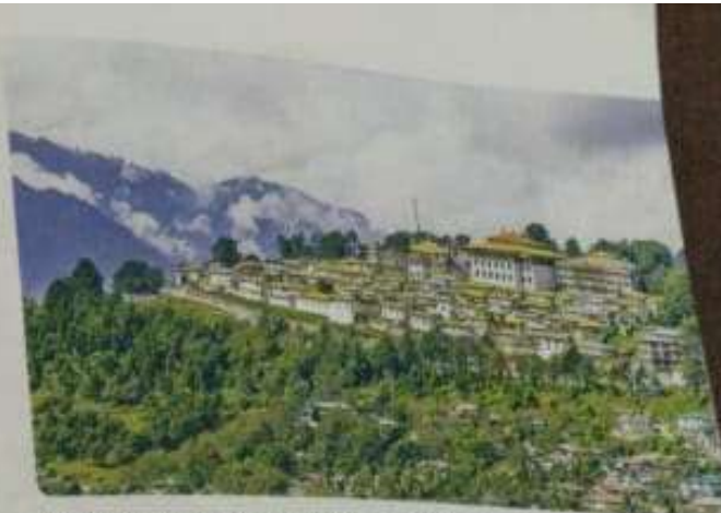
Tawang in Arunachal Pradesh is a popular tourist destination. It has the largest monastery in India.

fruit orchards and orchids. Some people do wood carving, carpet weaving and make bamboo and cane products. Itanagar, Ziro and Tawang are a few places of tourist interest.