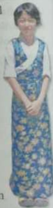
A Sikkimese girl dressed in bakhru

Sikkim is famous for oranges, cardamom and orchids. Some men and women wear a loose gown, fastened at the waist. It is called bakhru. They also wear colourful jewellery made from beads. The main tourist places are Gangtok and Pelling.