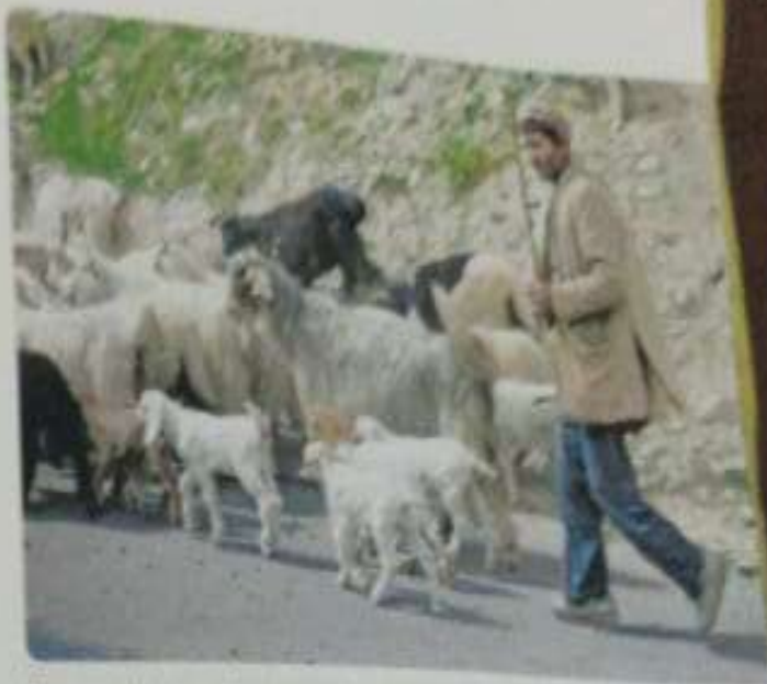
The availability of pastures has made sheep rearing an important occupation in the mountains.

Jammu & Kashmir and Ladakh lie in the Himalayas and the Karakoram Range. Himachal Pradesh, Uttarakhand, Sikkim, Darjeeling in West Bengal and some part of Arunachal Pradesh are in