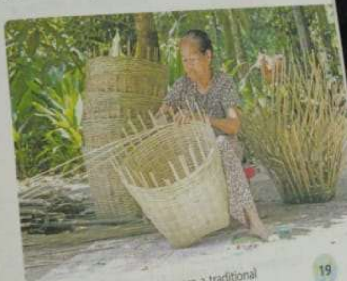
Baskets made from bamboo are a traditional handicraft of the north-eastern states.

Apart from farming and weaving, wood carving and pottery are also