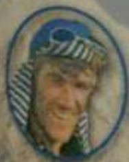
EDMUND HILLARY New Zealand, 1953