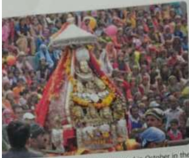
Kullu Dussehra is celebrated in October in the Kullu valley of Himachal Pradesh.