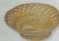
A bamboo handicraft.

Jute, rubber and bamboo are grown in Tripura. Bamboo is used to make handicrafts. People mostly speak Bangla and Kokborok. Agartala and Unakoti attract tourists throughout the year.